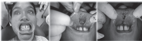
Upper labial frenectomy